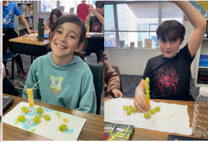
4th grade students make cheese and grape sculptures as they learn about eating healthy snacks.