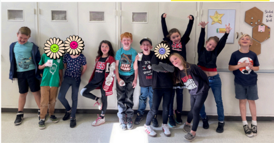
2nd graders show off their blueberry smoothie mustaches and their spirit!

Nom! Nom! Nom! These boys really enjoyed their quesadillas loaded with veggies.